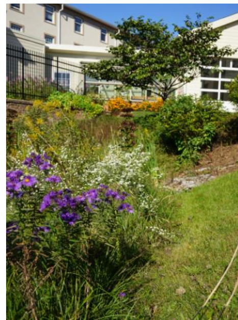
This protected swale is part of the gardens maintained by the StoneRidge Garden Club. The swale contains a variety of native wild plants and flowers including this deep-purple colored aster in the foreground.

*StoneRidge Retirement Living Communities is comprised of four retirement communities in South Central Pennsylvania. Locations include StoneRidge Poplar Run and StoneRidge Towne Centre both in Myerstown and Church of God Home in Carlisle and Schoolyard Square in Pine Grove. For more information about options available for you or a loved one, visit us online at www.StoneRidgeRetirement.com or call us at 717-866-3553. StoneRidge Retirement Living is all about just that—living!