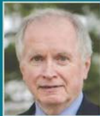
D. A. Carson

Distinguished Emeritus Professor of New Testament, Trinity Evangelical Divinity School; President/Founder, The Gospel Coalition; small-church pastor's son; author of many books, including a biography of his father, Memoirs of an Ordinary Pastor