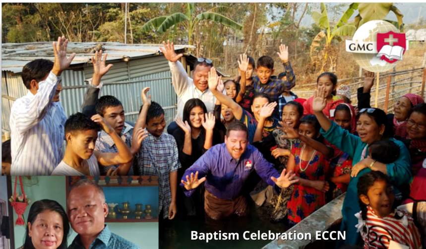
Baptism Celebration ECCN

This month we focus our attention on the EC Church of Nepal.