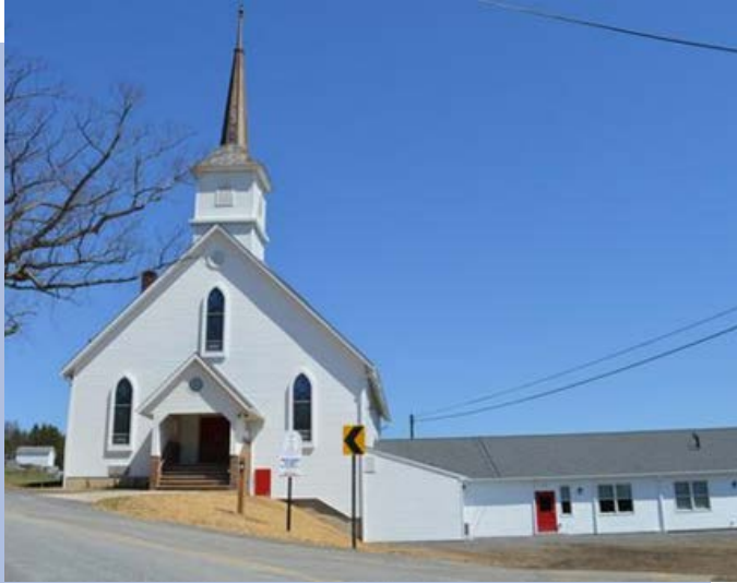
St. Matthew's 102 Church St. Kunkletown, PA 18058

When I was growing up, it was always exciting when someone new would move into the area, and I would have a new friend to get to know. Well, let me introduce you to my new friend (or should I say friends since they average about 75 people each Sunday), St. Matthew's of Kunkletown, PA!